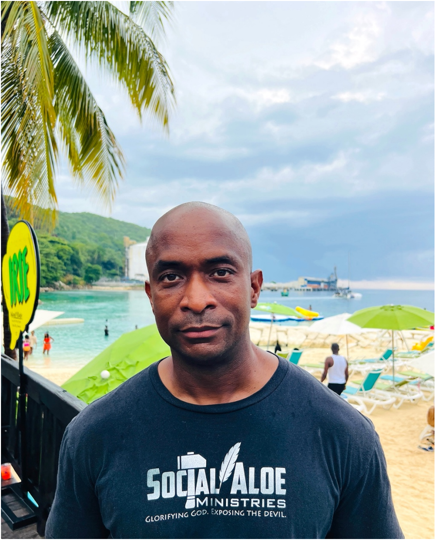
Author Photo by Mikiel